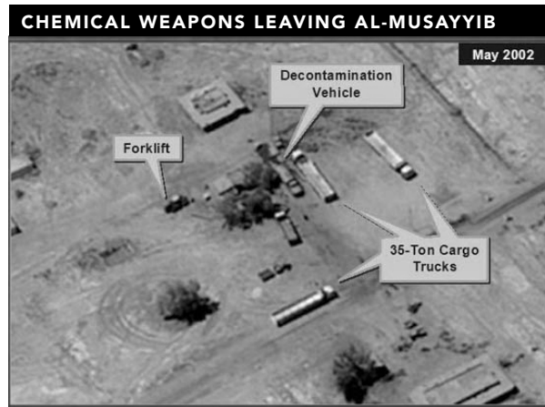
Briefing slides from Secretary Powell's February presentation to the UN.